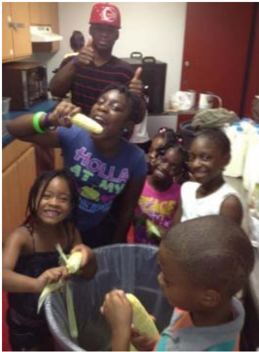
Summer Care Program youth visited the Farmers Market this year and got to husk and cook their own corn on the cob.