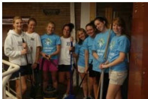
Student athletes from Southern Connecticut State University help clean up the track during Comcast's Annual Day of Caring, 2011

from Arizona and California joined New Haven youths for three days of sharing Learn and Serve projects with each other, and learning about the culture of New Haven through visits to the Peabody Museum and aboard the Schooner in New Haven Harbor.